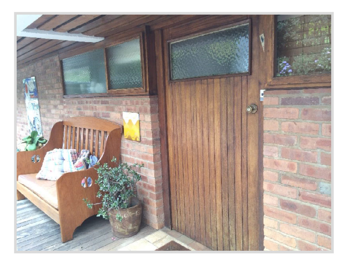
The door to my home

Entrances are important. They mark a boundary, or new beginning. Arriving and crossing that threshold is important to me.